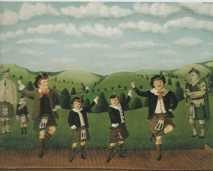
HIGHLAND HOLLOW / c. 1930–1935 / Oil on canvas / 26 1/2 x 36 1/2" / Carnegie Museum of Art, Pittsburgh / Gift of Mary and Leland Hazard, 1961 / 61.2.1

In 1896 Andrew Carnegie helped found the Carnegie International Exhibition, an annual show of contemporary painting. By the 1920s Kane had transcended his lack of formal training and was working on his art at every opportunity. Twice he submitted work to the prestigious International, and twice its jurors rejected the painted copies he naively thought were appropriate. But in 1927, the