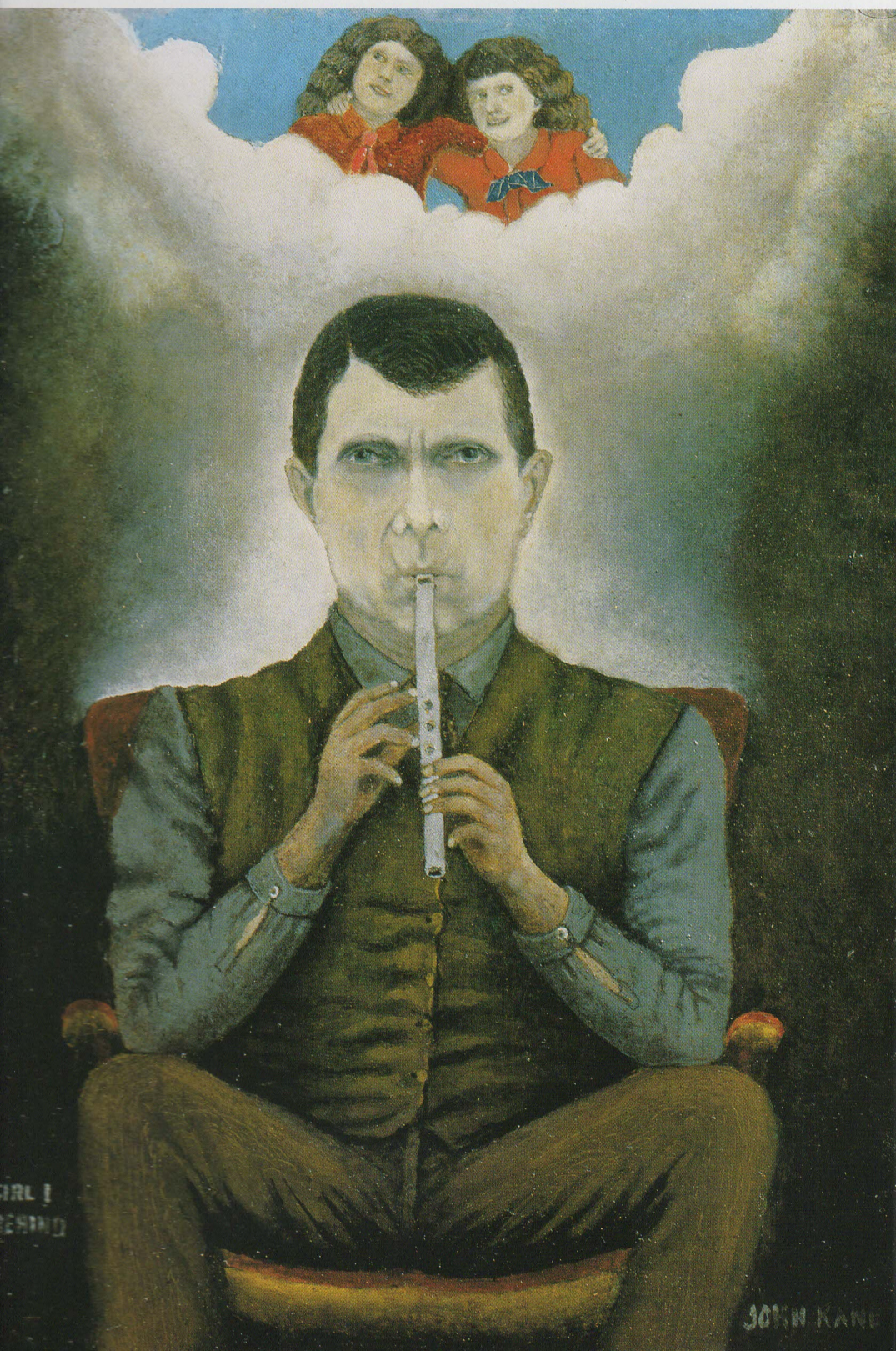
THE GIRL I LEFT BEHIND / 1920 / Oil on board / 15 3/8 x 11 1/8" / Collection of Janice and Mickey Cartin

In the same year, Kane created the third self-portrait with which we are concerned here, the striking, hierarchic composition in the collection of The Museum of Modern Art. 78 This unflinching view of a powerful man facing his eighth decade is all the more remarkable for its art-historical overtones. Did Kane come across an illustration of Albrecht Dürer's self-portrait executed in the millennial year 1500 while perusing art books in a Carnegie library? It certainly looks that way. Both artists chose a bilaterally symmetrical pose, with the subject looking out to confront the viewer. Both chose austere, dark backgrounds that evoke early Flemish depictions of Christ. Unlike Dürer, Kane depicted his two hands, a challenge for a self-portraitist who typically does not render the hand used for painting. Kane paid careful attention to the frame, demarking triple arches to emphasize his head, placing his loosely fisted hands "behind" the lower boundary, and bowing out his elbows toward the vertical edges, making contact on one side. Had Kane created only this one image, his standing as one of America's most important painters would be undiminished.