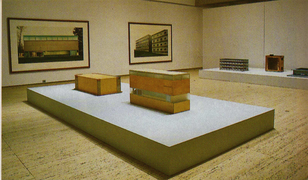
Installation view of Swiss partners Jacques Herzog & Pierre de Meuron's models of recent architectural projects, with German photographer Thomas Ruff's "Portraits" of the constructed buildings on wall.

His comment fingered the central challenge facing