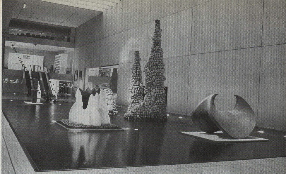
Above, sculpture installation by the Waka collective, a group of 11 artists of Maori, Polynesian, European and Asian descent, in the Watermill of the Queensland Art Gallery.

The Indian figurative painter and ecofeminist Nalini Malani assembled Body as Site , a meditative room installation of large mixed-medium wall drawings and fluid, expressionist renderings on milk-carton paper. In her artist's statement, Malani described the act of painting these women's bodies as an "incantatory ritual" that allowed her to record and then erase the marks of the world's devastations and ills. Her concern for