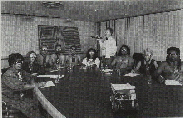
Campfire Group (Australia): "Boardroom" photograph of the group's members wearing "Aboriginal Design sunglasses" included in the installation/performance All Stock Must Go!, 1996.

name, Aotearoa. Apart from work by the few Japanese and Chinese artists who had previously exhibited in Venice and New York, the art was entirely new to me.