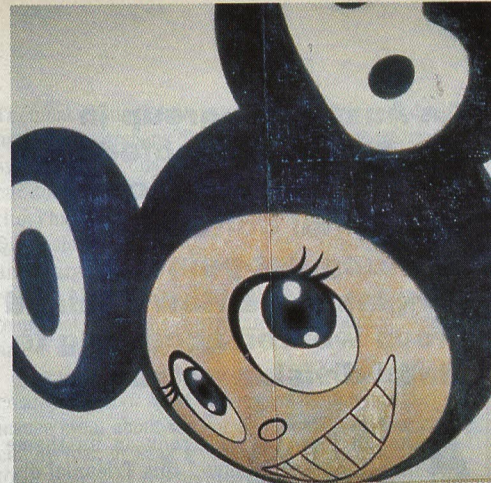
Above, Takashi Murakami (Japan): And then, and then and then and then and then , 1994, synthetic polymer paint on canvas, 110 by 118 inches. Courtesy Tomio Koyama Gallery, Tokyo.