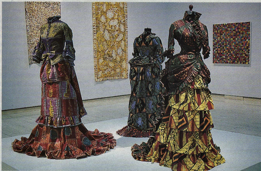
Above, installation view of the Sydney Biennale showing Yinka Shonibare's (England) How Does a Girl Like You Get to be a Girl Like You? (foreground), 1995, three costumes made with wax-print cotton textiles, 5½ feet high. Aborigine artist Emily Kngwarreye's silk batiks appear on left wall in background with an embroidered muslin work by Alighiero e Boetti (Italy) on right wall. Below, Kamin Lertchaiprasert (Thailand): Detail from Problem-Wisdom , 1995, a floor installation made with 366 papier-mâché sculptures, 42¼ by 6 feet overall (variable); included in the Asia-Pacific Triennial (APT).

What may be surprising is that this initiative was generated in Brisbane, Australia's third largest city, and not in Sydney or Melbourne, the country's better-known cultural hubs. Sydney was already committed to its Biennale, established in 1973 in part to mitigate Australia's physical isolation from Western cultural centers. Although East Asian artists were represented in the premier Biennale and in many subsequent ones, they were not its abiding focus. Brisbane's Queensland Art Gallery saw this vacuum and moved to fill it.