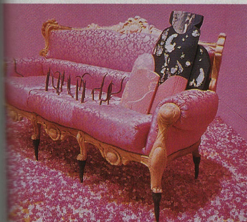
Suk-Nam Yun (South Korea): Pink Sofa, 1996, mixed mediums, dimensions variable. Collection the artist.

the environment was shared by the self-taught Taiwanese painter Ming-Tse Lee. His delicately colored, finely rendered panoramic composition, A Day in the Life of the Artist (1994), resembled a traditional scroll painting. Influenced by the model of the Chinese scholar-artists who addressed spiritual and moral issues in their paintings and poems, Lee depicted himself at his bath, regarding a despoiled landscape in which corruption and pollution have the upper hand.