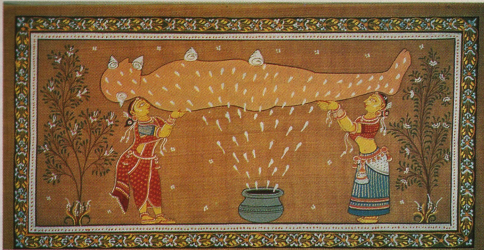
Francesco Clemente (Italy): From the series "Story of My Country," 1990, india ink and gouache on Orissa paper, five sets of 18 paintings, each 23 by 46 inches.