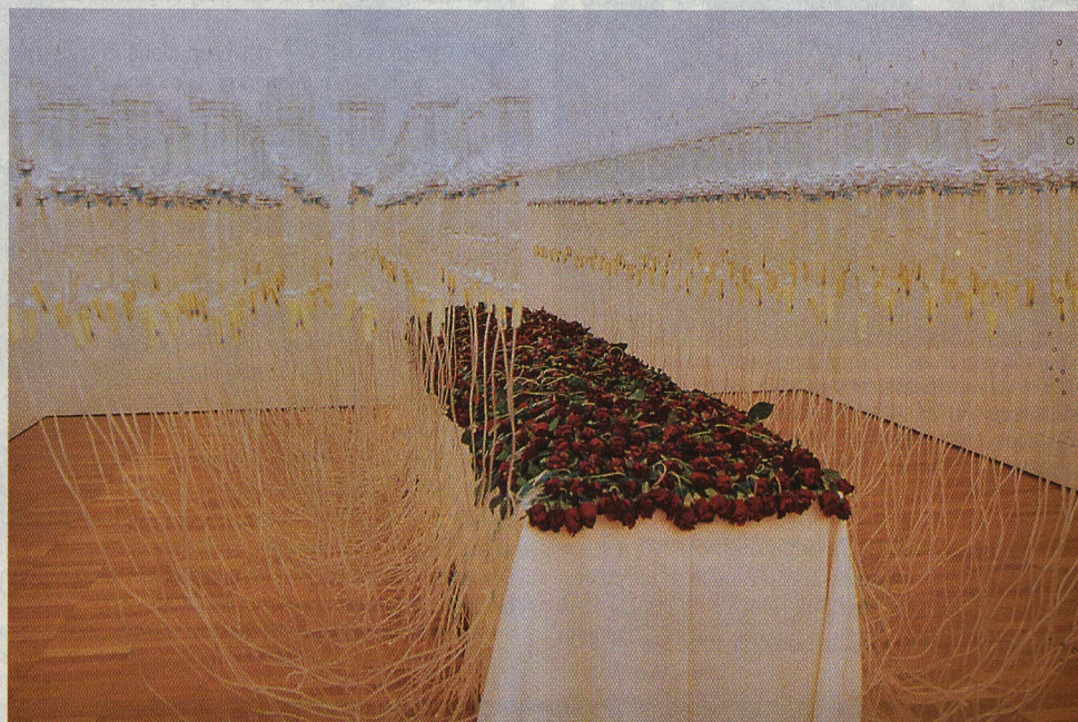
Below, Chen Yan Yin (China): Installation view of Discrepancy Between One Idea, 1996, roses and IV drip bottles. Works this spread were included in the APT.