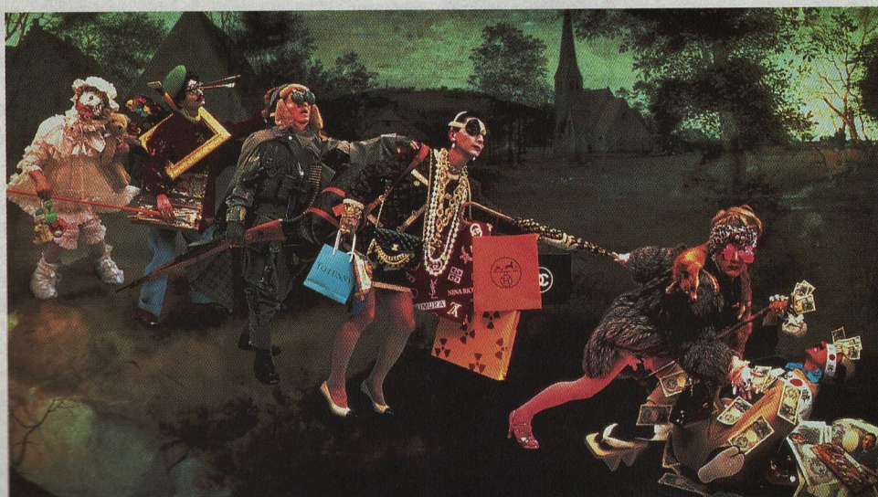
Yasumasa Morimura (Japan): Blinded by the Light , 1991, color print with varnished surface on plywood, 81 by 143½ inches.

Mindful that such expansive, pioneering shows as the