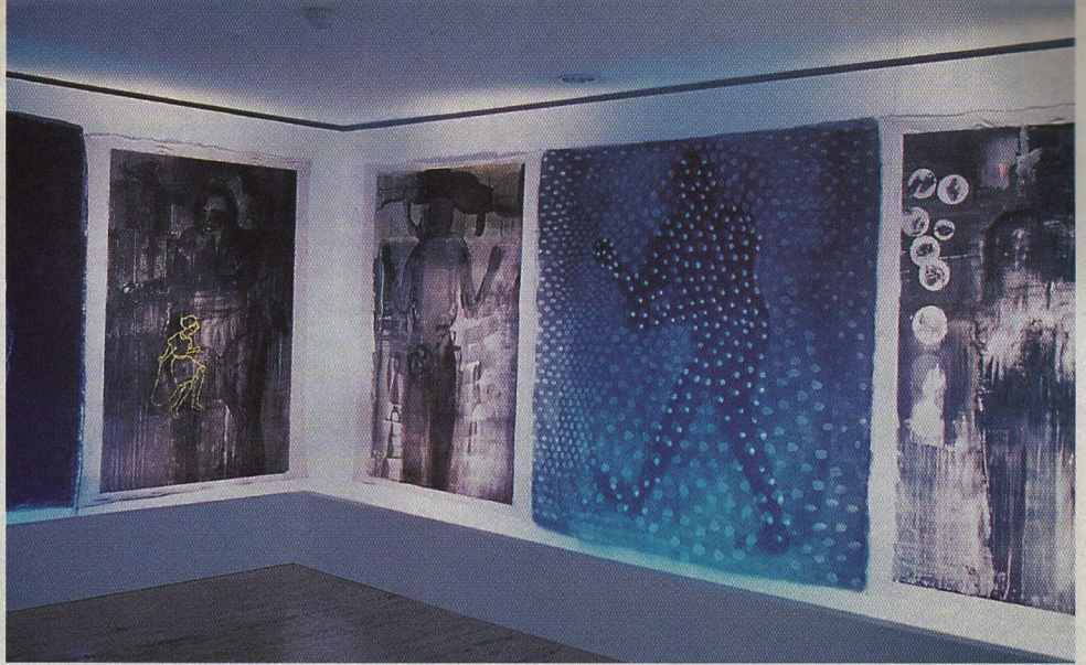
Nalini Malani (India): Body as Site , 1996, a room installation with wall drawings, mixed mediums.

4. Caroline Turner, "Introduction—From Extraregionalism to Intraregionalism?" The First Asia-Pacific Triennial , Brisbane,