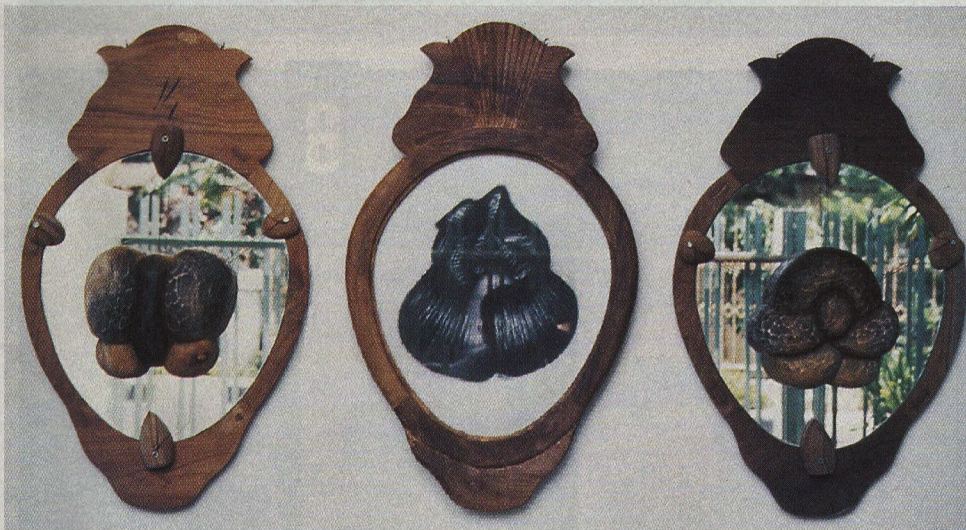
Above, Nindityo Adipurnomo (Indonesia): Installation detail of Introversion (April the Twenty-First) , 1995-96, mixed mediums, 21 pieces, each 29½ by 17½ by 6 inches.