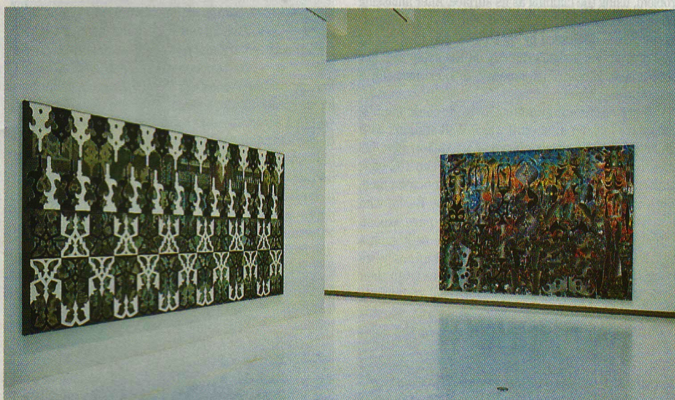
Above, Philip Taaffe (United States): Installation view of White Volta (left) and Tsuba Forest (right), both 1995-96, mixed mediums on canvas, 103 by 124 and 103 by 130 inches. Courtesy Gagolian Gallery, New York. Below, Emily Ngwarreye (Australia): Installation view of silk batik works from the late '80s. All collection The Holmes à Court , courtesy Heytesbury, Perth. Works this spread were included in the Sydney Biennale.